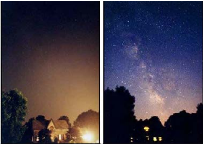
Typical lighting (on left) compared to dark sky approach (on right)