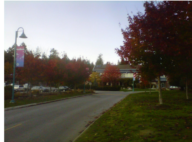
Red Maple Trees ( Acer rubrum ) along Rosina Giles Way