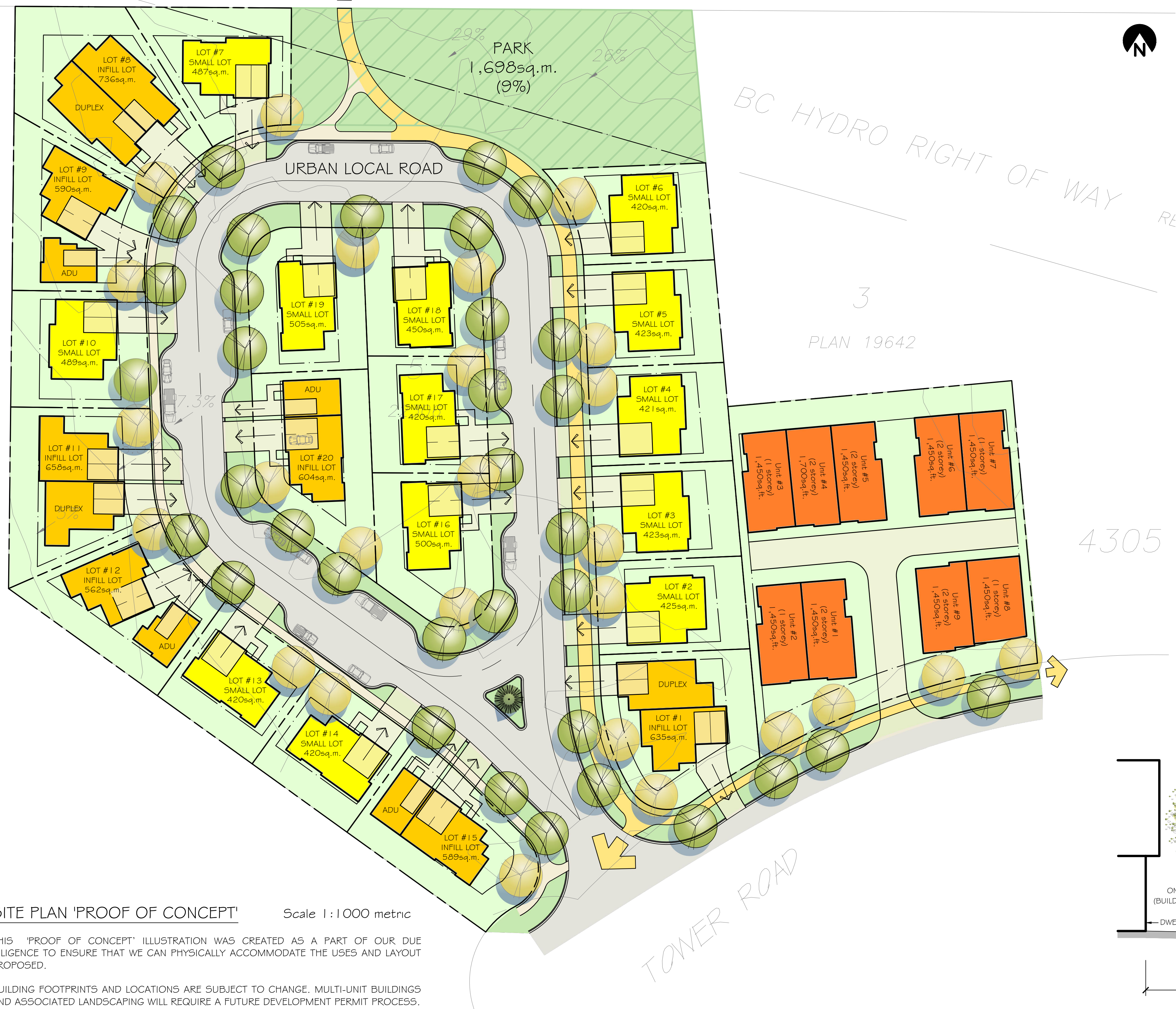
SITE PLAN 'PROOF OF CONCEPT' Scale 1:1000 metric

THIS 'PROOF OF CONCEPT' ILLUSTRATION WAS CREATED AS A PART OF OUR DUE DILIGENCE TO ENSURE THAT WE CAN PHYSICALLY ACCOMMODATE THE USES AND LAYOUT PROPOSED.